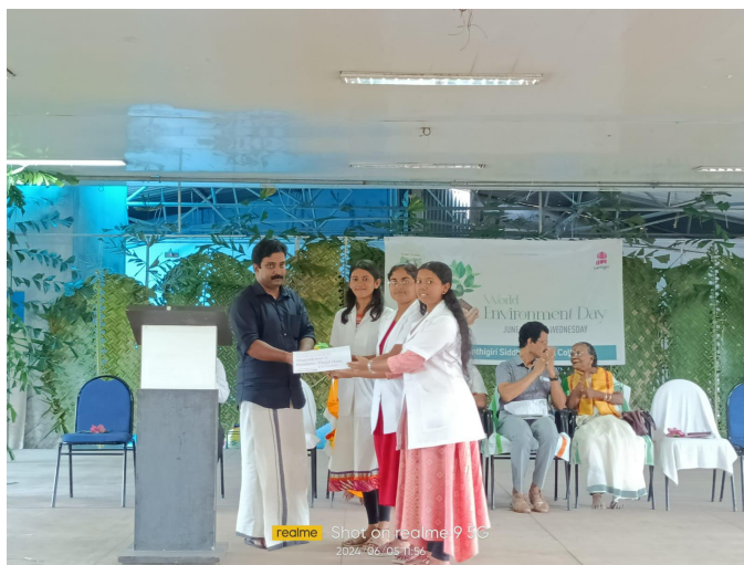
First Prize: SPACE Team