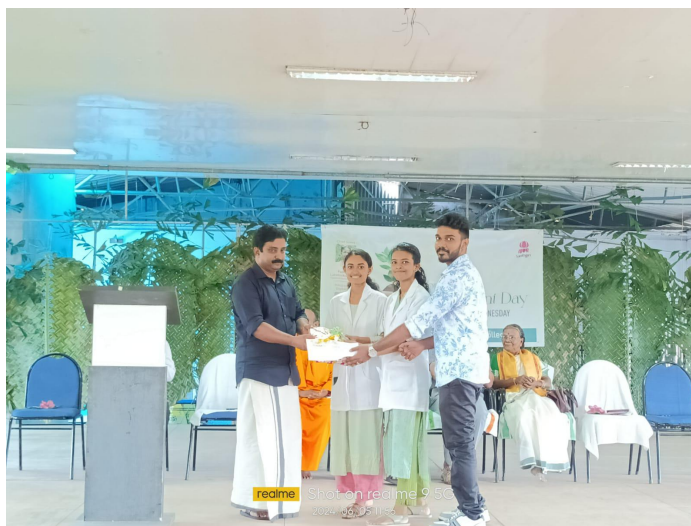
Second Prize: FIRE Team