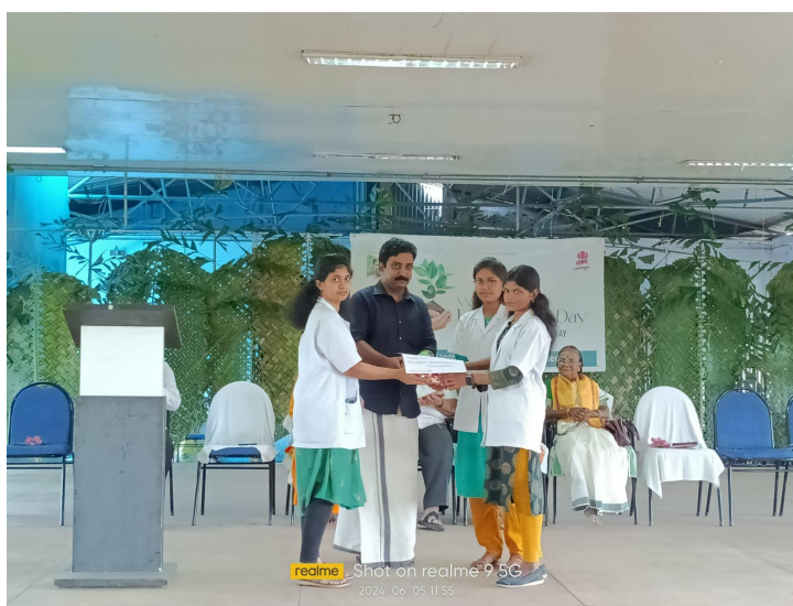
Third Prize: AIR Team